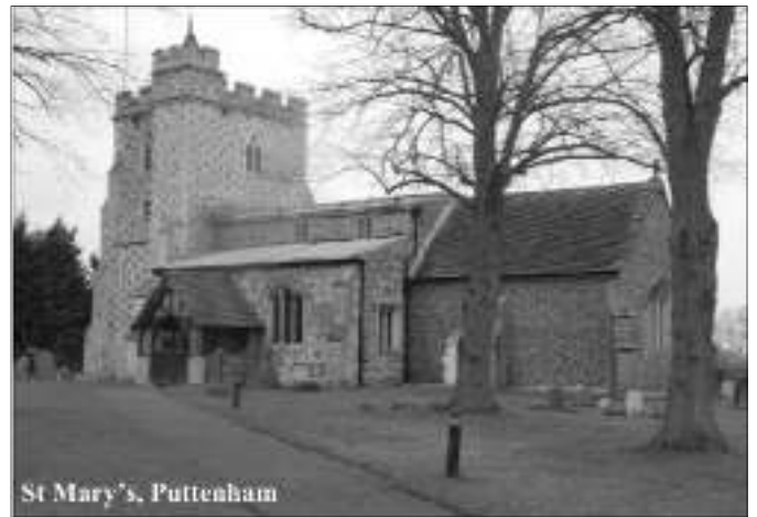
St Mary's, Puttenham

10.00am All Saints Holy Communion 3.30pm St Mary's Evensong