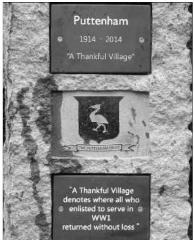
"A Thankful Village" denotes where all who enlisted to serve in WW1 returned without loss.