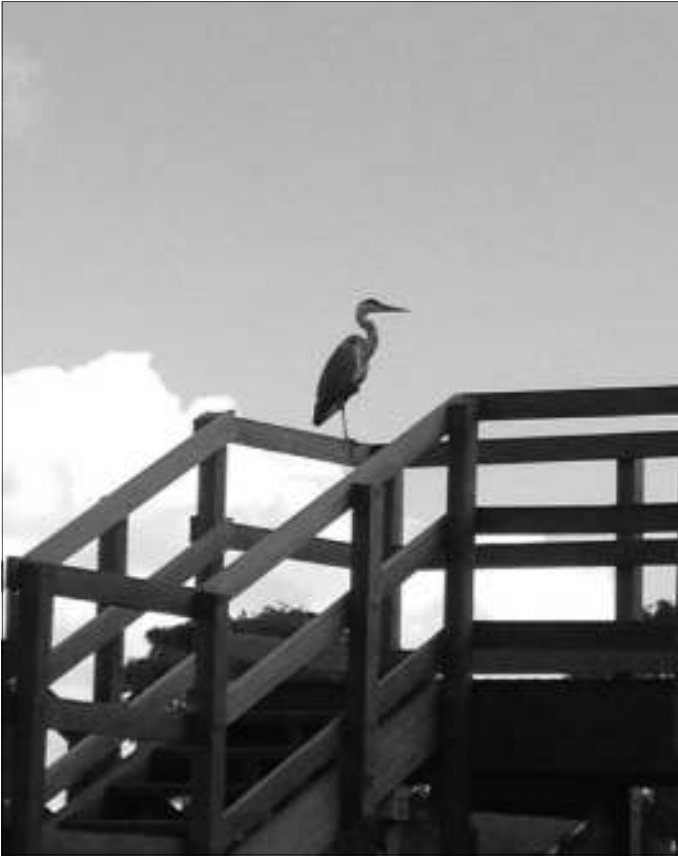
Just checking for the Bailiff