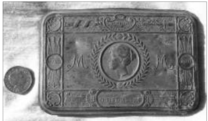
Found in the Long Marston brook. Princess Mary's portrait and initial form the centre piece of this 1914 Christmas gift. The names of the allied nations are arranged around the sides, together with images of flags, arms and ships. (£1 coin for scale.)

So what's the mystery? It is that I found one here in Long Marston. Not a replica - there is no doubt it is the real thing. Only the lid mind, but that is the interesting part anyway. While pulling a brick-end out of the Long Marston brook near my home (basic flood precaution measure) I also saw in the mud what I thought was a discarded roof tile. But on