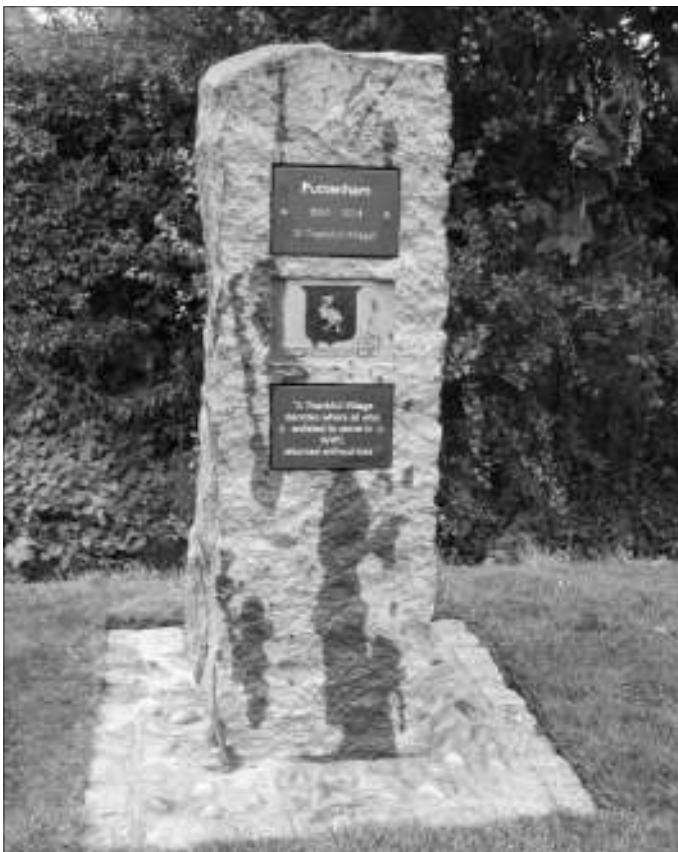
The obelisk of Cornish granite carrying the plaque was organised by the Puttenham Trust.

It was said during the event, that the torrential rain they stood in was nothing compared to what the soldiers would have had to endure while serving in WW1.